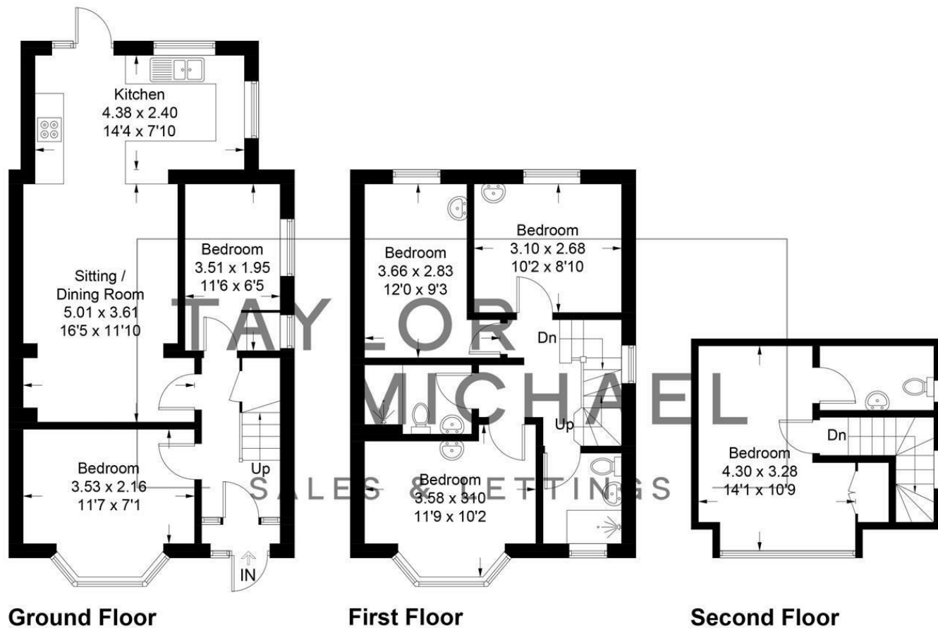
Illustration for identification purposes only, measurements are approximate, not to scale. Imageplansurveys @ 2025